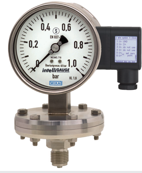
intelliGAUGE® model PGT43HP